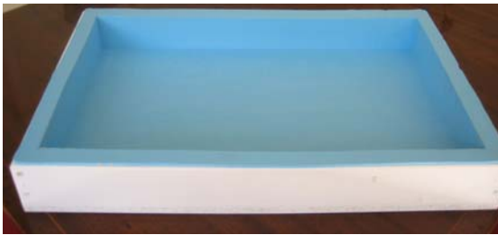
Slab Mould in Wooden Support Box