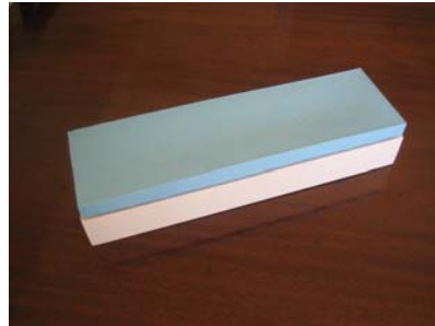
Assembled Tub Mould