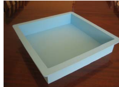
Typical Slab Mould Silicon Liner